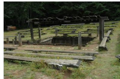
Sumeg Village Dance Pit

The highlight of the museum tour was the Native American Collection from Northwest California tribes. It is no wonder that the Smithsonian is covetous. The Native American basket collection is extensive. Baskets were essential to the everyday life of the Native Americans. Pottery was not in use. Baskets were used for a variety of purposes: cooking, carrying, storage, winnowing, hopper for grinding, hats, eel traps, etc. Cooking baskets were very tightly woven using materials such as willow that swells to hold water. The outside of the baskets were decorated in tribal designs using collected materials. Other available materials were used for daily use. Mussel shells were used by woman as spoons; men's spoons were carved from wood. Dentalia shells from British Columbia were trade currency. Tools were made from stone such as chert, sourced in Oregon and obsidian probably sourced from Mount Lassen.