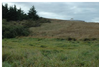
Slough below Yontocket