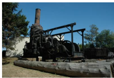
Washington Slackline Yarder at Fort Humboldt