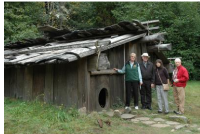
Sumeg Village Plank House