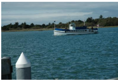
Madaket Pulp Mill